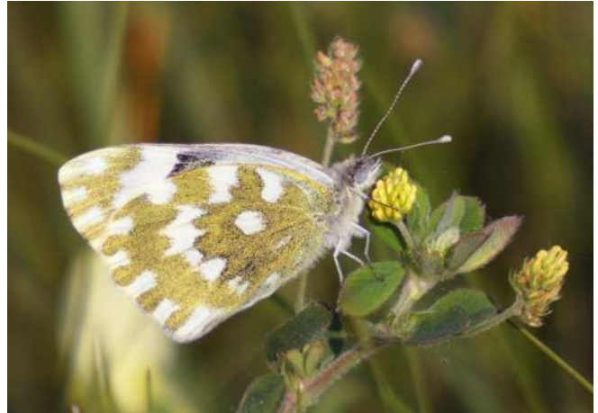
Top: two fritillaries, Niobe and Cardinal sunning themselves; bottom, Safflower Skipper – a lifer for some – and Eastern Bath White

Common Blue Polyommatus icarus Nettle-tree Butterfly Libythea celtis Lesser Purple Emperor Apatura ilia Common Glider Neptis sappho Northern Comma Nymphalis c-album Red Admiral Vanessa atalanta Painted Lady Vanessa cardui Peacock Aglais io Map Araschnia levana Cardinal Argynnis pandora Silver-washed Fritillary Argynnis paphia Niobe Fritillary Argynnis niobe Queen of Spain Fritillary Issoria lathonia Glanville Fritillary Melitaea cinxia Knapweed Fritillary Melitaea phoebe Lesser Spotted Fritillary Melitaea trivia Common Marbled White Melanargia galathea Common Meadow Brown Maniola jurtina Small Heath Coenonympha pamphilus Chestnut Heath Coenonympha glycerion Oberthür's Grizzled Skipper Pyrgus armoricanus Safflower Skipper Pyrgus carthami Mallow Skipper Carcharodus alceae Essex Skipper Thymelicus lineola Small Skipper Thymelicus sylvestris Large Skipper Ochlodes sylvanus