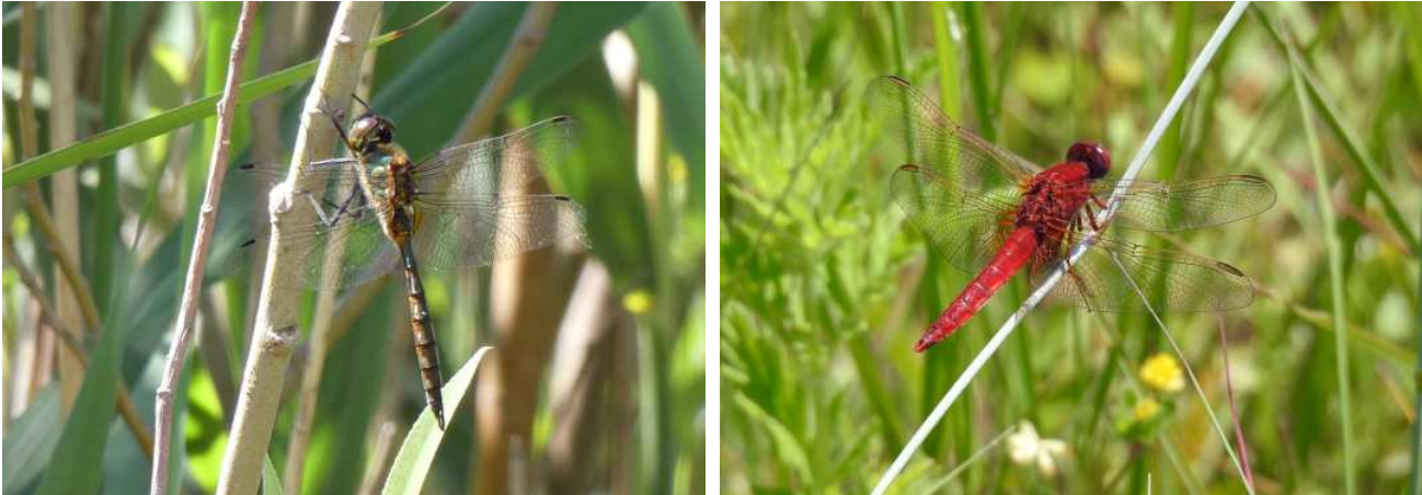
Two dragonflies to brighten the day: Yellow-spotted Emerald (David Walsh) and Scarlet Darter (Bill Branford)

Osh, our guide for the morning, explained how the open water on a small fraction of Lake Kolon has been recreated in recent years; the 'lake' had simply become a large reedbed. We then boarded a silent electric boat and spent 90 minutes slowly touring the lake. We saw more birds than I was expecting, a Great Reed Warbler perching up nicely, four Whiskered Terns flying over, a group of Pygmy Cormorants sitting in a dead tree and, best of all, a number of Squacco Herons allowing close approach. The variety and number of dragonflies was staggering. Lake Kolon is internationally renowned for Large White-faced Darters and our trip clearly coincided with the species being present in peak numbers. We also had super views of another speciality, Yellow-spotted Emerald; several were seen flying close to the boat and we saw others when back on dry land. Male Scarlet Darters were the pick of the 'supporting cast'.