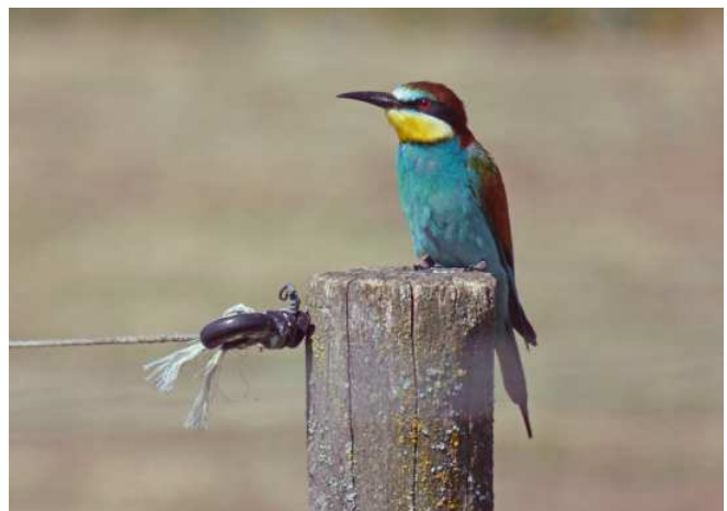
Rainbow-coloured Rollers and Bee-eaters were both seen well today

Pausing again by a church in an isolated copse, we marvelled at the fields full of Yellow Rattle; we discussed the fact that its abundance is a good indicator of a rich meadow. Gábor talked to us about the success of the nest box programme in helping boost the population of Rollers and, as he did so, we watched one interacting with a Corn Bunting! The first of numerous mystery insects was later identified as a Red-legged Assassin Bug! We watched a traditional horse and cart move along the track before returning to the lodge to enjoy our picnic and relax over a coffee; Gábor and Tibor began their quest to mend the moth trap which we hoped to set up later in the week. A Broad-bodied Chaser at the pond was a nice surprise for those keen to make the most of every minute in the field!