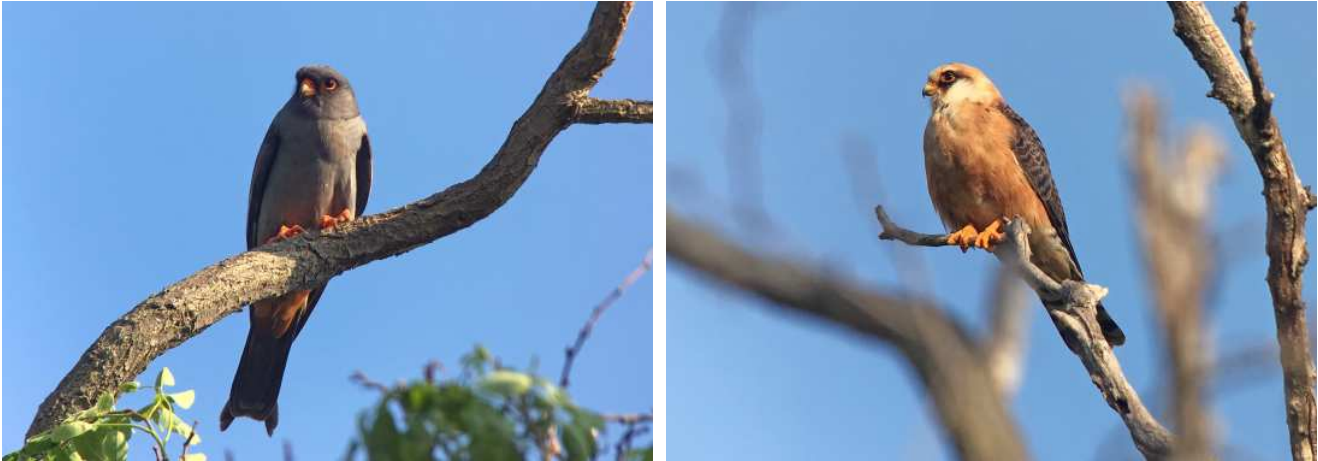
There are few finer falcons than Red-footed: here a male and female pose nicely

Rather than retrace our steps we drove on from the hide, turning left along the back of the fishponds. To our right we found a roosting group of 30 Spoonbills, an impressive count. The last pond on the left was shallow with small islands and we spotted a small group of Black Terns as well as 30 Avocets, a Curlew and three Black-tailed Godwits. The views of these, and the ducks we had seen earlier, were excellent once we had parked up and set up the scopes. We then walked along a bank on the opposite side. Our target here was Bluethroat and, by walking a little further along, one was eventually located; it sat up from time to time and most, but not all, of us managed to see it despite our best efforts.