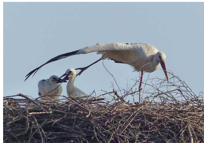
Trip photos (from top): Bird of the trip, the nest-building male Penduline Tit by the Tisza River • A splendid male Squacco Heron on water lilies • The hide at the lodge was good for Hawfinches • Wing-stretching White Stork plus young • A Lesser Spotted Fritillary • Large White-faced Darter on Lake Kolon