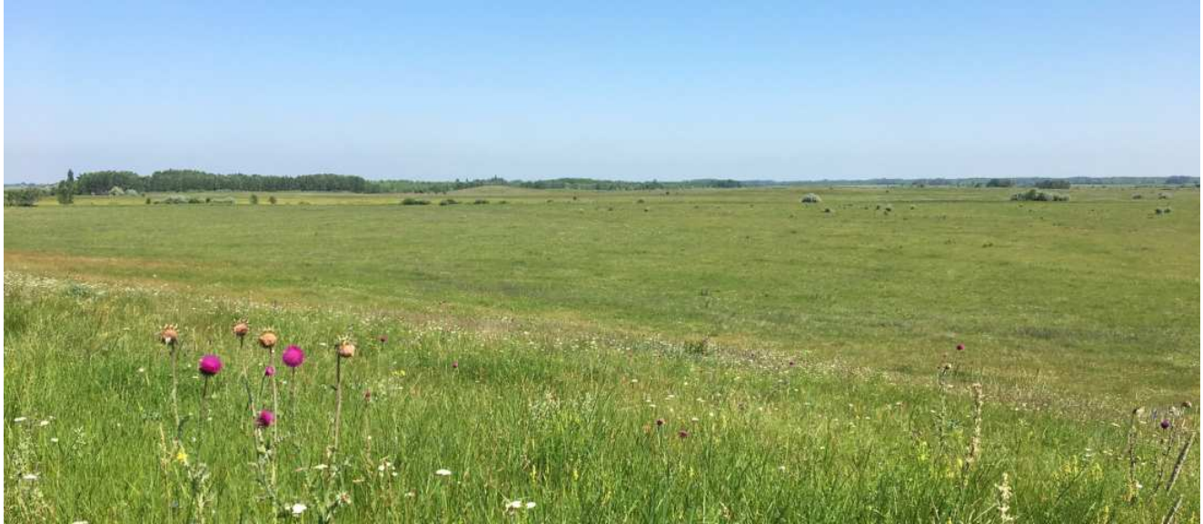
The puszta near Bugyi; we saw five imperious male Great Bustards in similar habitat