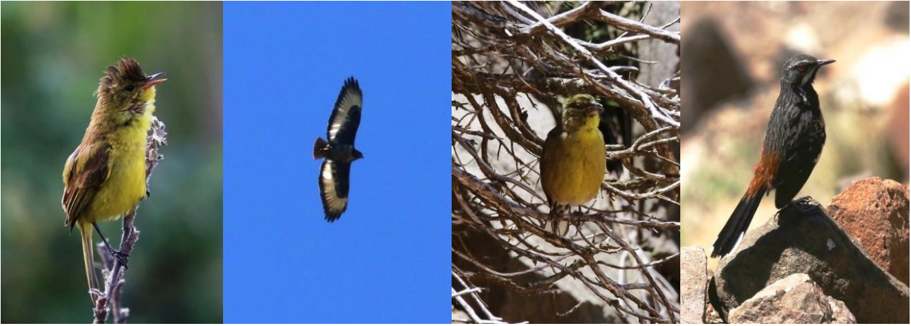
Rockjumper, Drakensberg Siskin and Large-billed Lark. An interesting mammal to be found at the top of the pass is Sloggett's Ice Rat.