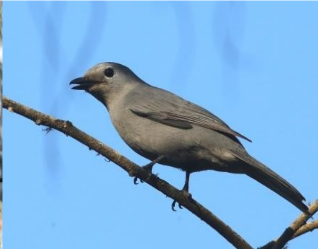
Day3 - Entebani Forest & Levuvhu River